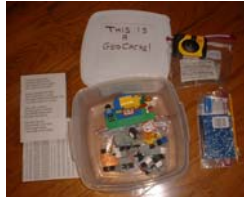
Example of contents